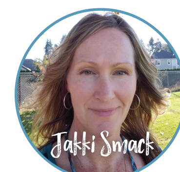
Jaki Smack Horizons Elementary

"A success story in the making, the progress of summer chum recovery in Hood Canal suggests that delisting is actually possible. LLTK has contributed in major ways, and the result is not just one restored salmon stock, but restored hope."